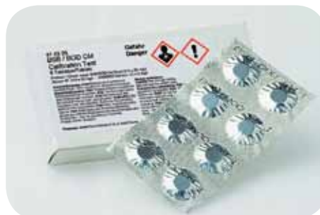
BOD CM test tablets, order code: 41 83 28

The tablets are easy to use. Simply place a tablet in the BOD bottle, start the measurement process, read off the BOD value after 5 days, and then compare with the defined value. If this value is within the quoted tolerance, this means that the BOD measuring system is functioning correctly.