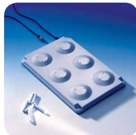
Inductive stirring system

The microprocessor-controlled Lovibond® inductive stirring system is non-wearing and maintenance-free. In other words, there are no moving parts in the system.